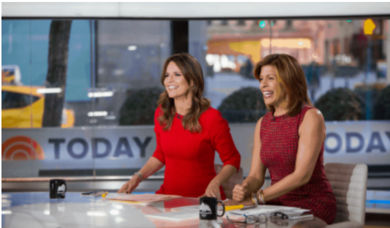
NBC News TODAY