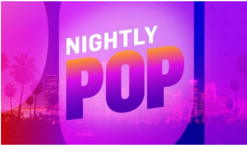
E! Nightly Pop USA NXT 2.0