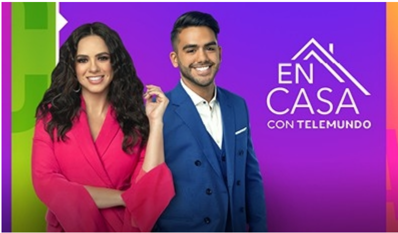
Telemundo En Casa Con Telemundo