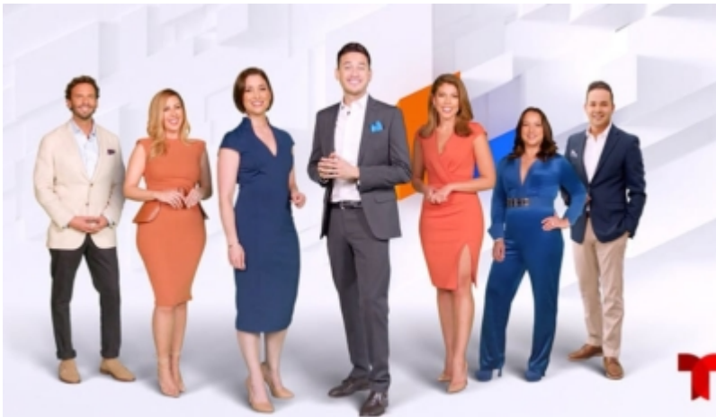
Telemundo Hoy Día Telemundo Latinx Now!