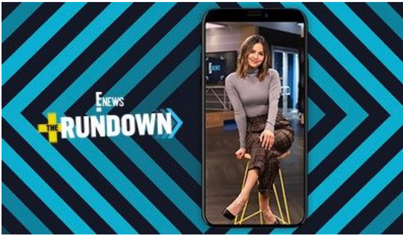
E! E! News The Rundown