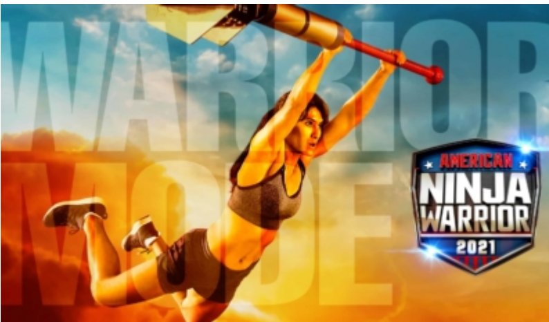
NBC American Ninja Warrior