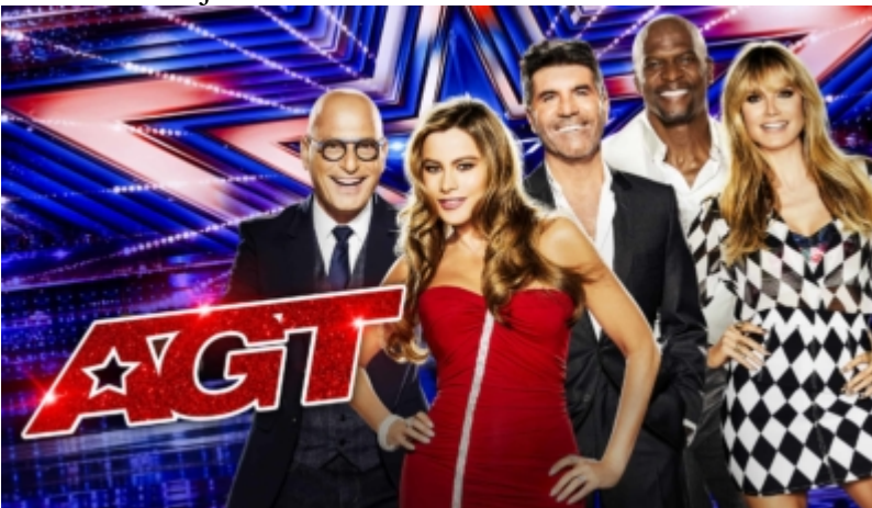
NBC America's Got Talent