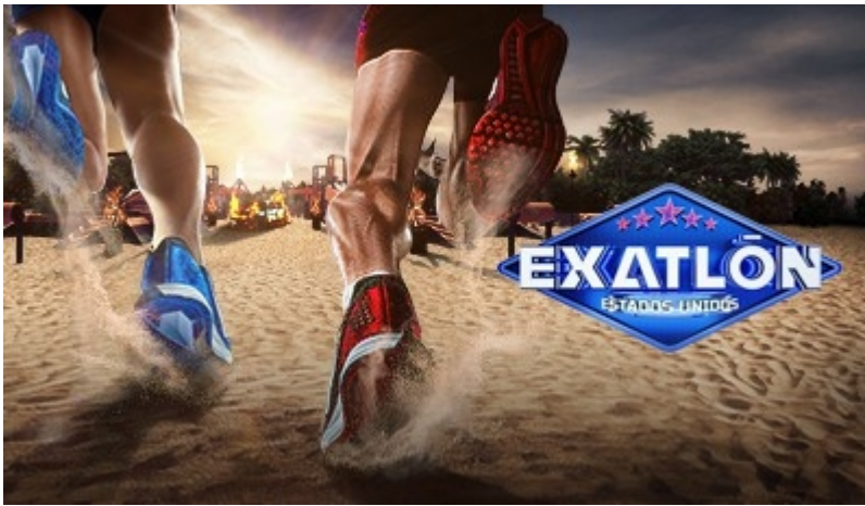
Telemundo Exatlón NBC The Voice