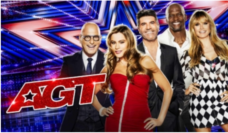
NBC America's Got Talent