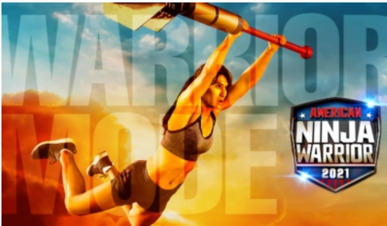
NBC American Ninja Warrior