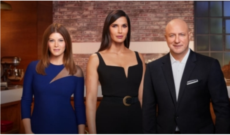
Bravo Bravo's Top Chef