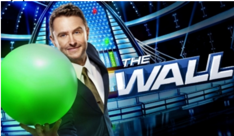
NBC The Wall